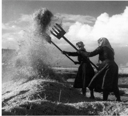
Threshing Wheat in Macedonia <aegilops.gr>

Since organic fertility management differs from conventional fertility management, the genetic variability of wheat varieties' capacity to scavenge and accumulate protein and minerals is a key trait. Protein content has a greater influence on flour quality than any other factor