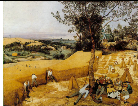
Harvesters - Pieter Breugel, 15 th c Heritage wheats have large roots for organic nutrient absorption, are tall for photosynthesis

Since the dawn of agriculture, farmers have been selecting crops to develop the foods we eat today. For over 10,000 years, heritage wheat has been the staple food for humans. However today genetic management has shifted into the hands of industrial breeders but with hidden costs. Most commercial wheats are patented to prevent farmers from saving them, replacing heritage wheats world-wide. Modern wheat, the most widely grown crop on earth, is bred for uniformity and yield. Flavor is not a criteria. Nutrition is forgotten 2 . Important characteristics, such as extensive root systems for nutrient-use efficiency, height for weed competition, and durable horizontal resistances to diseases are decreased. 3 The unprecedented erosion of diversity has resulted in fewer varieties, limiting food security, nutrition and culinary art. Organic farmers, artisan bakers and people that like to eat are seeking heritage wheats' robust health, higher nutrition and delicious taste. Where are the heritage wheat seeds?