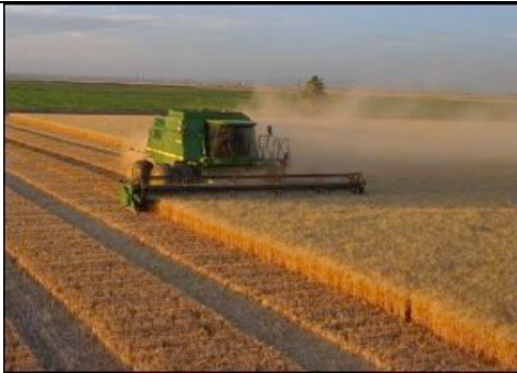
Kansas Wheat Commission Modern wheats bred for uniformity, dwarfed to not lodge with synthetic N

Wheats whisper the journeys of the peoples who carried them, the trading, migrations and conquests that are kneaded into our breads. The heritage wheat grown in North America originated in the Fertile Crescent and Europe. When people immigrated to the New World, they brought landrace wheats from their homeland. 1 These are the wheats that nourished earlier peoples, but today are on the verge of extinction, replaced by modern wheats bred in agrochemical-soaked fields for high yield and uniformity.